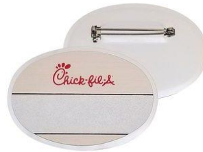
Nametags Price: $5