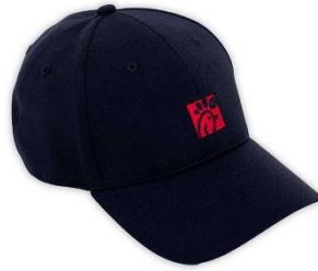
McCalla Hat Price: $8