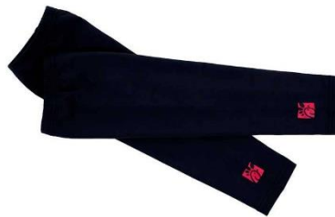
Performance Sleeves Price: $12 Sizes: S/M or L/XL