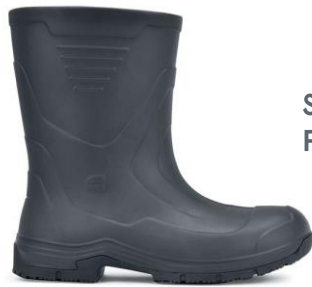
Slip Resistant Boots Price: $42