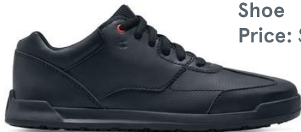
Women's Liberty Shoe Price: $32