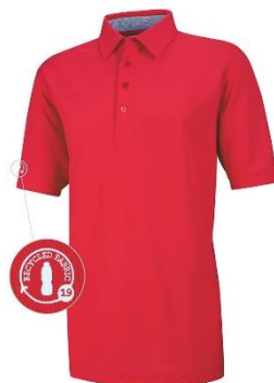
Male Howell Solid Polo