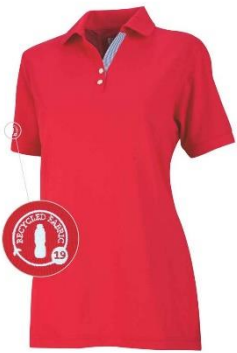
Female Howell Solid Polo