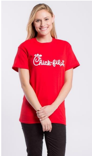
CFA Script TEE Price: $7 Sizes: S/M/L/XL/2XL/3XL