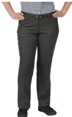
Female Pelham Pant

XS/S/M/L/XL/2X (+$1)/3X (+$1) / 4X (+$2)/5X (+$2)/6X (+$3)