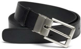
Belt Price: $13 Sizes: S/M/L (+$1)