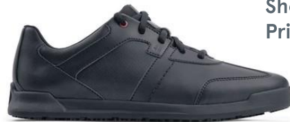
Men's Freestyle Shoe Price: $32