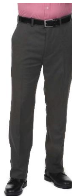
Male Pelham Pant